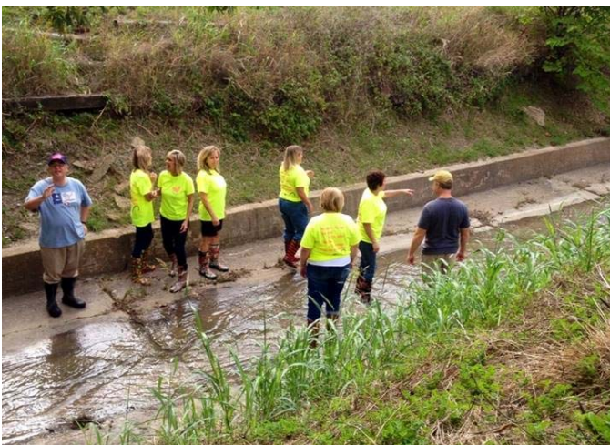
Volunteers waiting to catch the winning Ducks in the Rotary Duck Race.

Many members of our congregation are involved in the 35 th Annual Red River County Historical Society Fall Bazaar. We hope that you will come out and enjoy a full day of activities. There will be excellent music, good food, great fellowship and a chance to win a prize in the Rotary Club Duck Race!