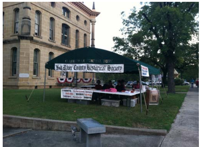
Red River County Historical Society's booth at the Fall Bazaar.